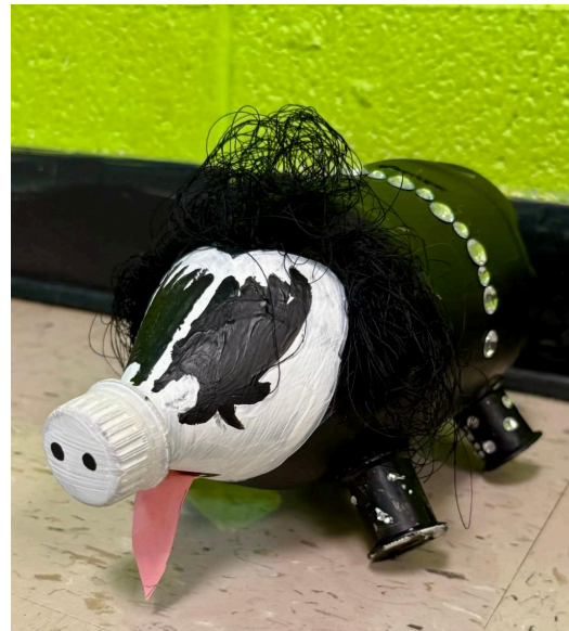
5th grade 2nd place piggy bank by Talon Friddell, Snow Hill Elementary