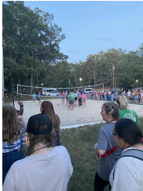
Beach Volleyball was one of the many activities to choose from