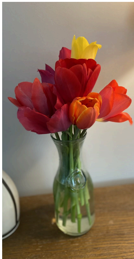
TVF second place "Plants"