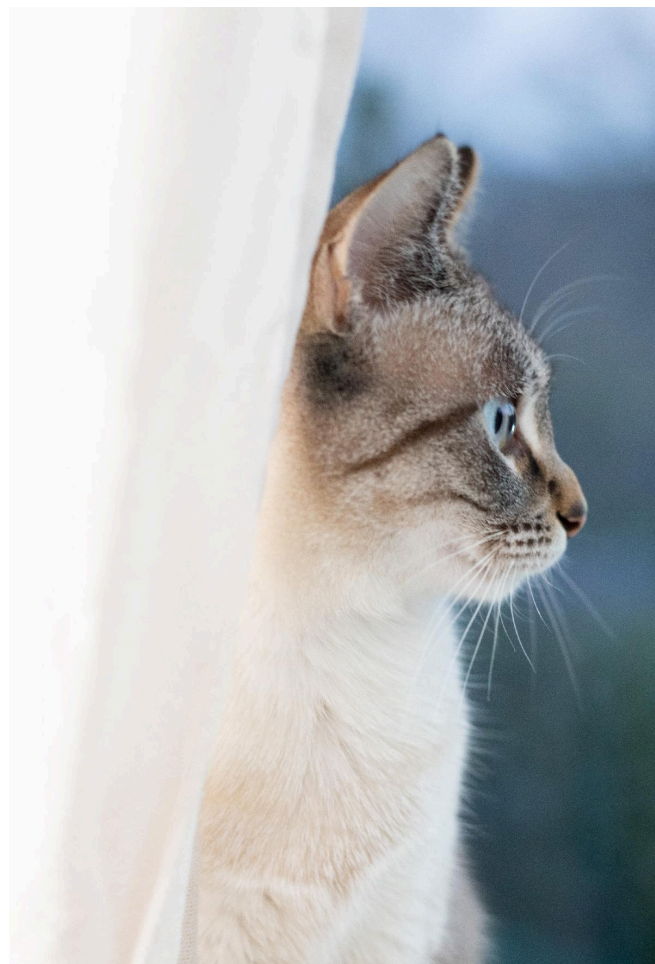
Tennessee Valley Fair Junior Best of Show photo by Norah Wade