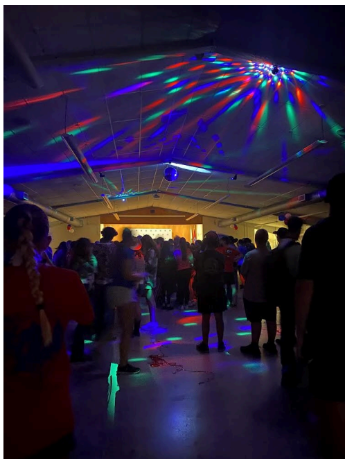
Dance time at SRTLCL