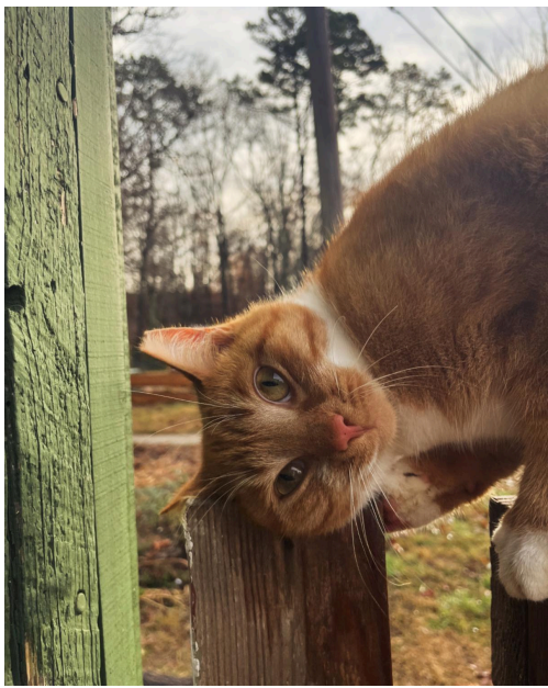
TVF third place "Animals"