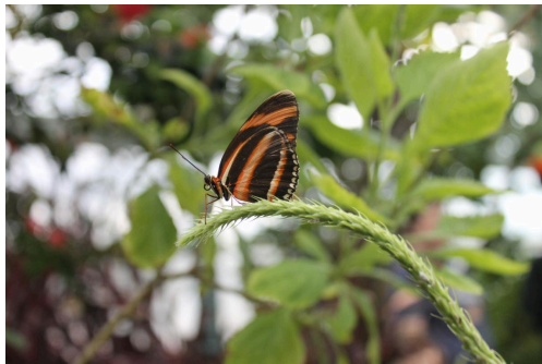
Tennessee Valley Fair first place "Animals"