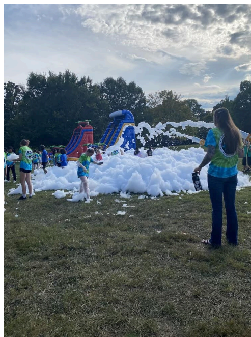
The Foam Party was a lot of fun!