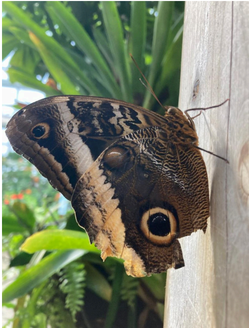
TVF 3rd place "Close Ups" photo by Wyatt Taylor