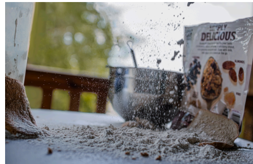
Tennessee Valley Fair first place "Still Life" photo by Kyler Loynd.