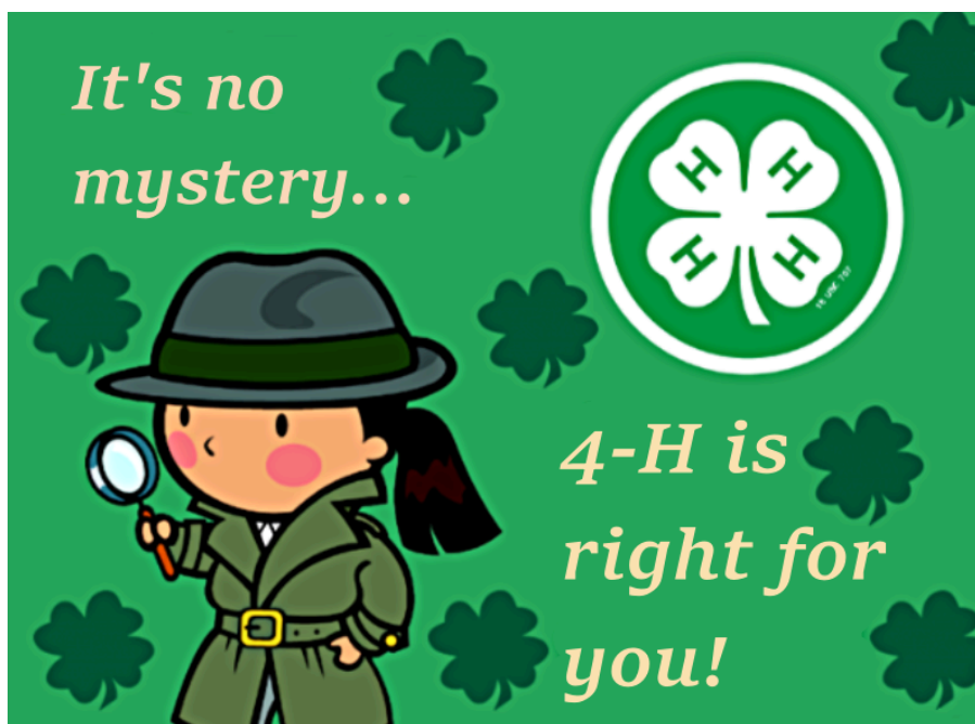
Digital Poster by Edith Provence, 4-H Archery Club