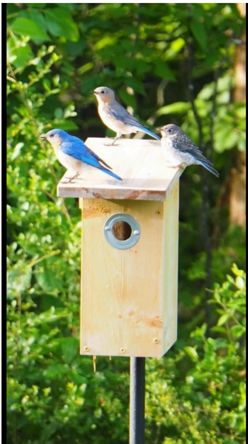
2023 Contest entry by Lynn Simmons

Enter the Extension Month Photo Contest by sending in your best photos to the Extension Office by March 21! Both youth and adult competitions are available. Find out how to enter this contest (entries must follow guidelines) at the Extension Office website .