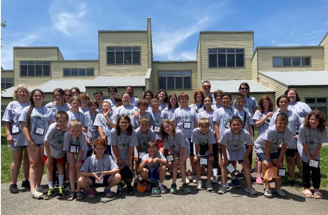
2024 Junior 4-H Camp Hamilton County group

Youth who have finished 4th, 5th, or 6th grade in Hamilton County can attend 4-H Junior Camp at Clyde Austin 4-H Center in Greeneville, Tennessee! This is a fun week filled with making new friends and trying out great activities like fishing, swimming, wildlife walks, Ga Ga ball, archery and rifle ranges, group games, tie-dyeing shirts, and much more. Cost is $400, which includes transportation to and from camp, lodging, meals, and most activities. Online camp fee payment is available at tiny.utk.edu/4HJrCamp . Scholarships are available. Visit the Extension Office website's junior camp page for more information.