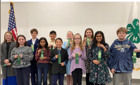
Fabulous Fifth Graders at the County Public Speaking Contest. 5th grade participants