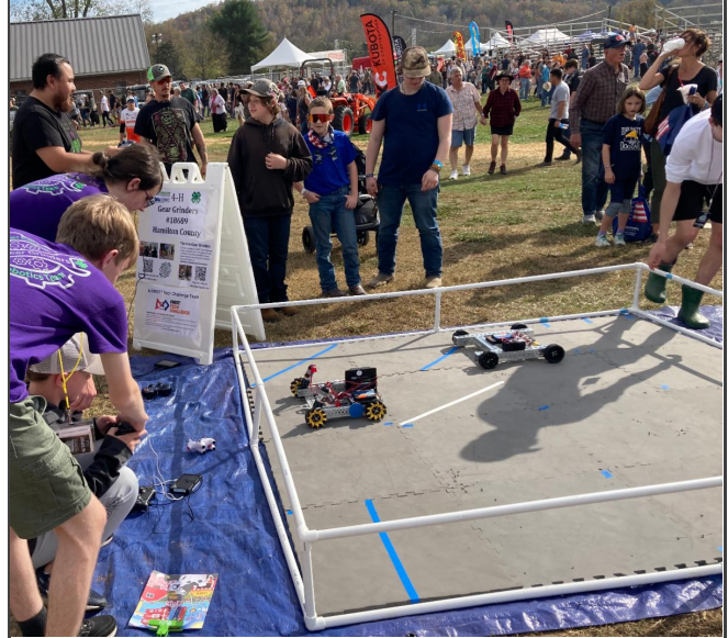
The 4-H Gear Grinders Robotics Club demonstrated robotics to large audiences at the Fair