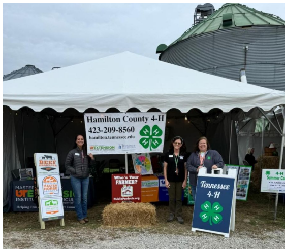
The 4-H Tent at the Hamilton County Fair was the place to be!