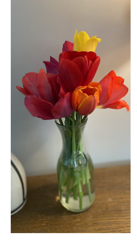
TVF second place "Plants"