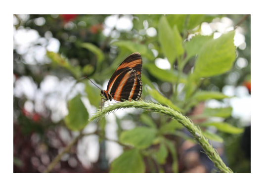
Tennessee Valley Fair first place "Animals"