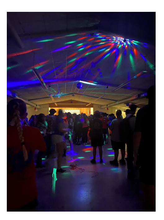
Dance time at SRTLC