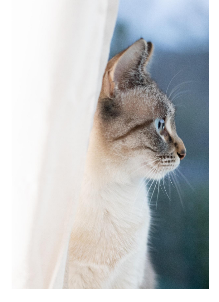
Tennessee Valley Fair Junior Best of Show