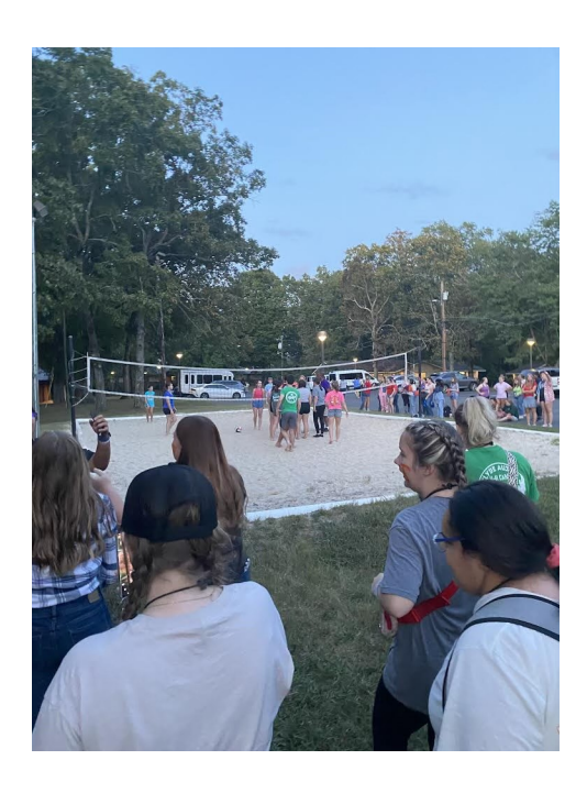
Beach Volleyball was one of the many activities to choose from