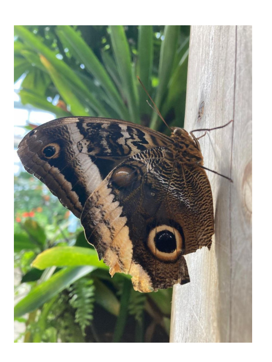
TVF 3rd place "Close Ups"