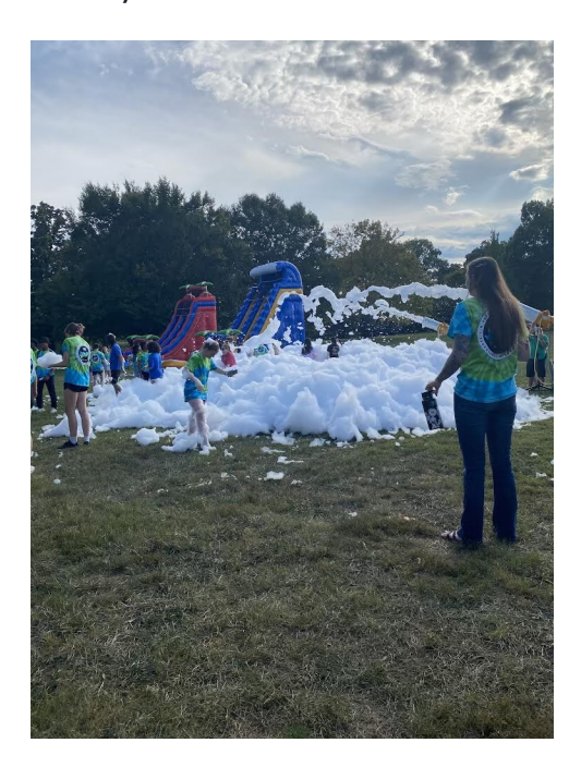
The Foam Party was a lot of fun!

4-H Shooting Sports - New Shotgun Discipline