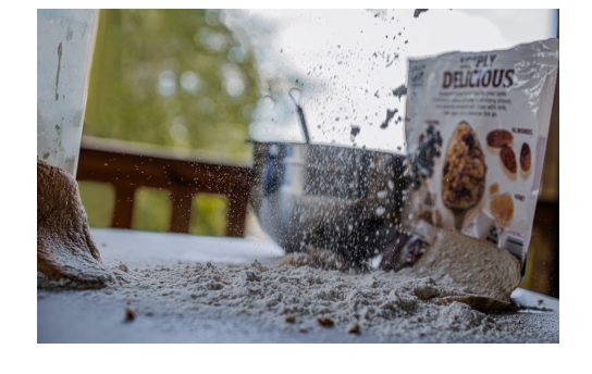
Tennessee Valley Fair first place "Still Life" photo by Kyler Loynd.