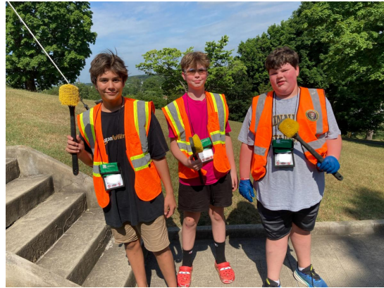
The whole camp was hosed down by the local fire department to help clean up after the slime war!