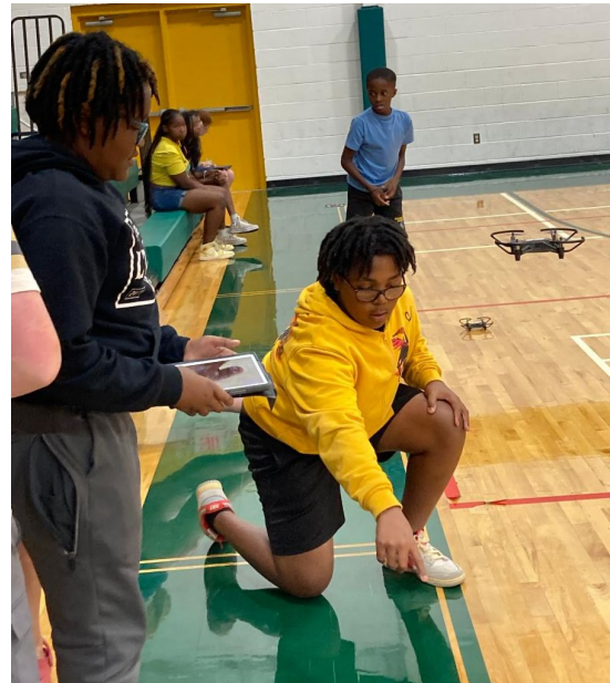
Programming and flying drones made a great team activity!