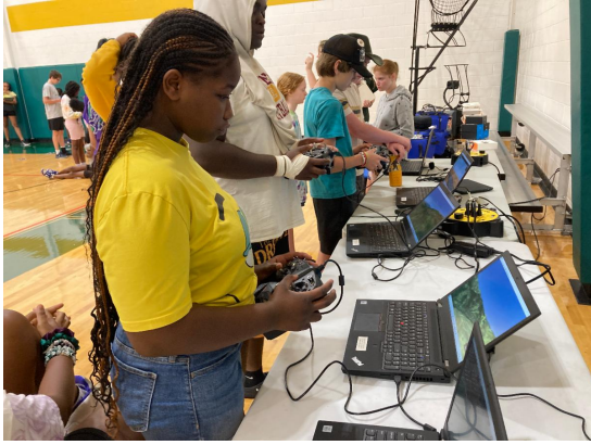
Trying out a flight simulator game at STEM day camp!