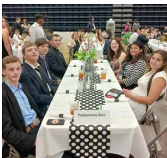
4-H Roundup Banquet