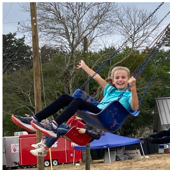
350 4th graders from 5 County schools (Alpine Crest Elementary, Big Ridge