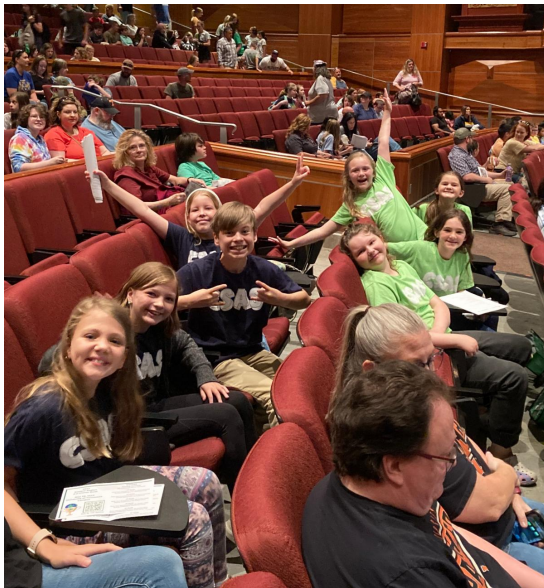
Hamilton County's 4th and 5th grade teams, from Chattanooga School for the Arts and Sciences, waiting in the Alumni Building Auditorium for the competition to begin

and teachers who helped them prepare for the competition!