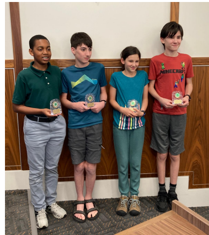
Hamilton County's 8th grade team finished in 3rd place in their grade division.