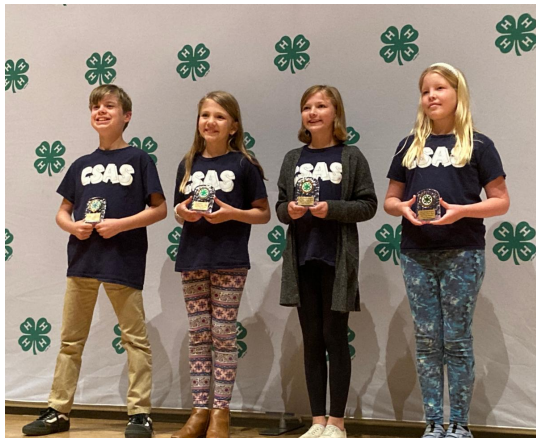
Hamilton County's 4th grade team finished in 3rd place.