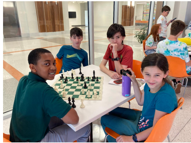
Hamilton County's 8th grade team members, from the Robotics and Gardening Clubs, hanging out in a lunch room at the Student Union on the UTK campus as they waited for their turn in the seeding round.