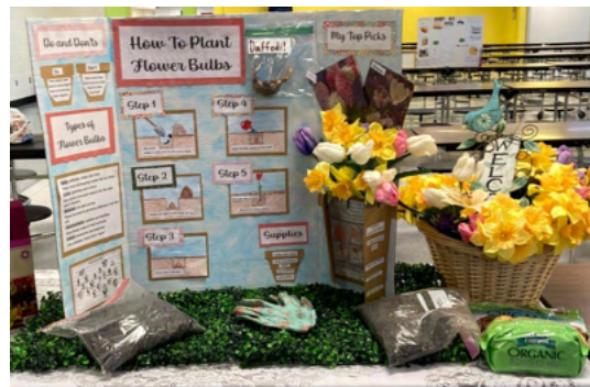
Lillian's interactive exhibit showed how to plant flower bulbs and had examples of bulbs she has planted and the beautiful flowers they produced