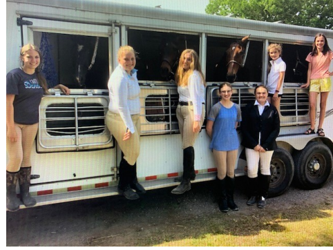
Group at horse trailer between classes