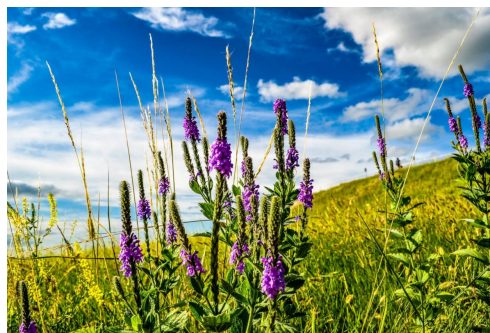
Gracie Sikes' photo, "Lavender in South Dakota," won in last year's youth division in the Plants and Flowers category.

This contest is also open to adults. See below for entry information.