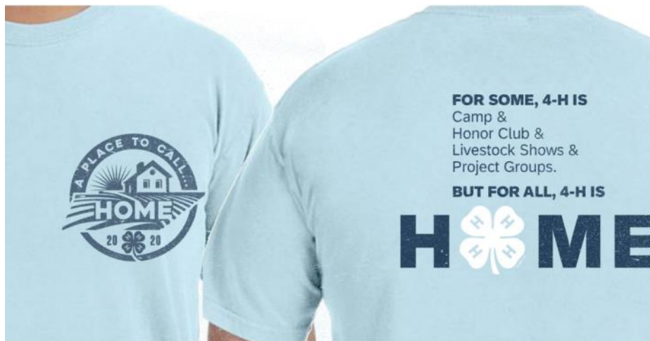
4-H Home T-shirts

The 4-H Update will be sent out monthly this summer. To receive the update by email, call the office (423-855-6113) or email nrucker@tennessee.edu